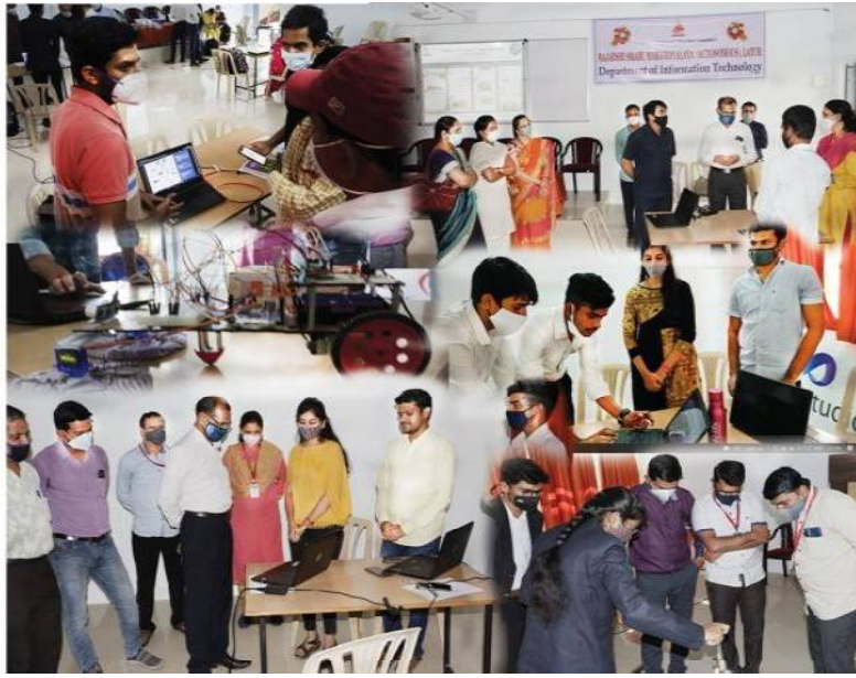
Students presenting their projects